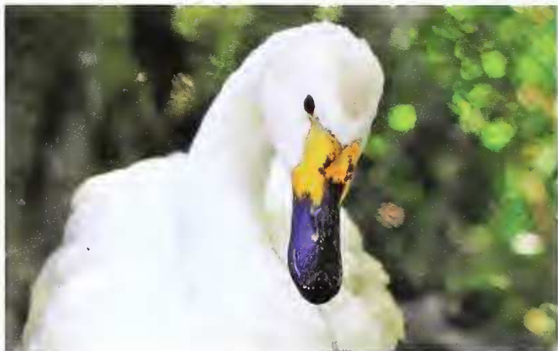
Plate 2. Tundra Swan Cygnus columbianus , DENR CENRO Virac, Catanduanes, 24 April 2012.